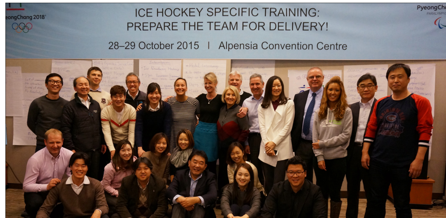
The IIHF, IOC, and PyeongChang 2018 Olympic Winter Games Organizing Committee held the first meeting of the Transfer of Knowledge program in Korea, designed to instruct POCOG on organizing a top-level international ice hockey tournament.