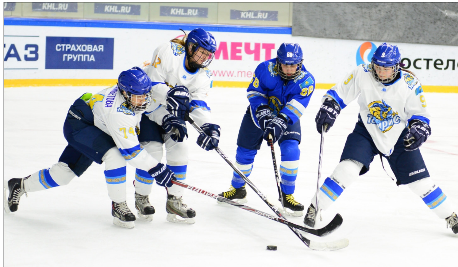
One of the 29 Global Girls' Game stages between Team Blue and Team White took place in Astana, Kazakhstan.