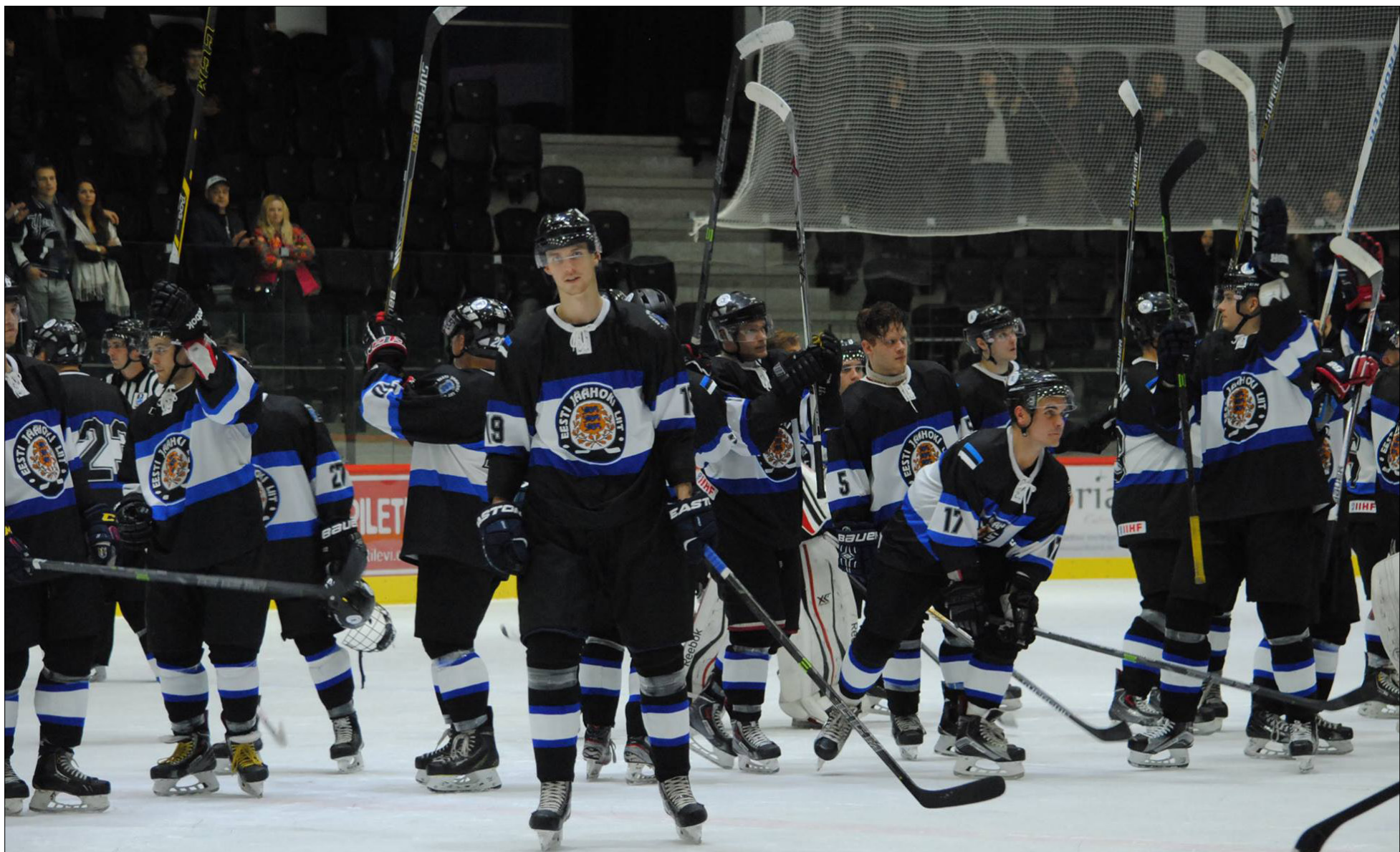
Estonia celebrates after a win against Israel in Round 1 of the Olympic Qualification in Tallinn. The team went undefeated against Mexico, Israel, and Bulgaria.