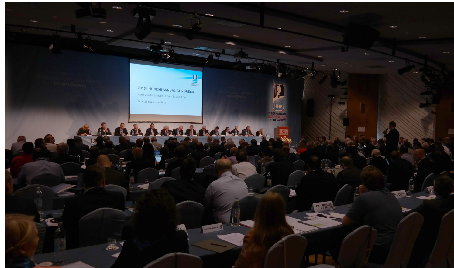
The 2015 IIHF Semi-Annual Congress confirmed all the dates and locations for the IIHF World Championship program.

At the event Austria, Slovenia, Poland, Japan, Italy and Korea will battle for promotion to the top division for the 2017 IIHF Ice Hockey World Championship in Cologne, Germany, and Paris, France.