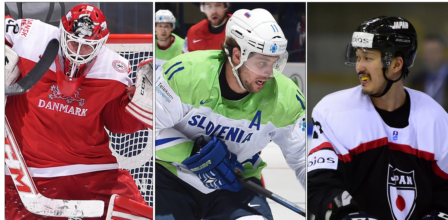
Slovenia (centre) qualified for its first Olympics in 2014. Other nations like Denmark and Japan will try to follow in 2018.

For the 2018 Olympic women's ice hockey tournament the top-5 nations of the 2016 IIHF