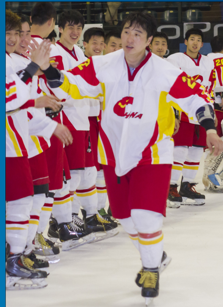
China, host of the 2022 Winter Olympics, will compete in Group L of the 2018 Men's Olympic Qualification Preliminary Round 1.

IIHF Ice Hockey Women's World Championship Division II Group B Qualification BULGARIA, Sofia 07-10.12.2015