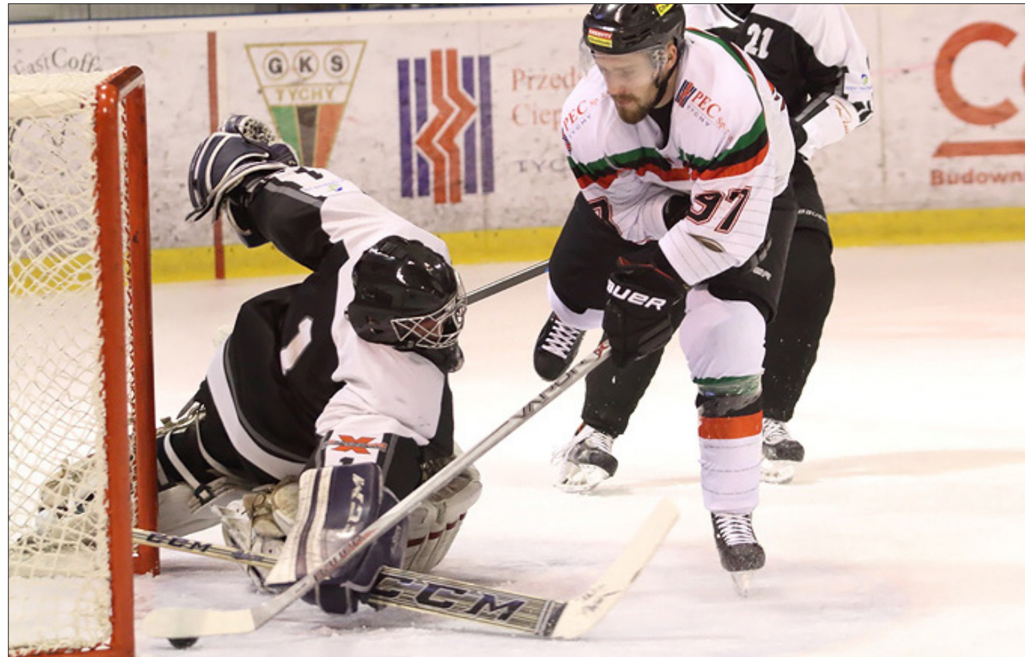
GKS Tychy's 26-0 romp over Partizan Belgrade was the highest single-game goal tally for a team in Continental Cup history.

On the final day if Jesenice beat Riga, then it would all come down to the Miskolc-Jaca match, but Riga took care of business and the home team put on a goal festival for their fans as they beat Jaca 10-2.