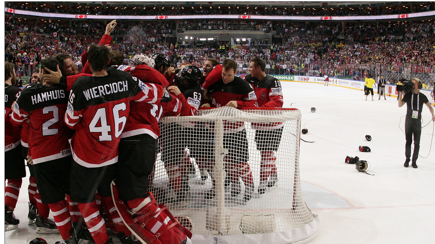
A cumulative audience of over 1 billion people around the globe watched the 2015 IIHF Ice Hockey World Championship.

In terms of onsite attendance, this year's tournament also achieved a new record with