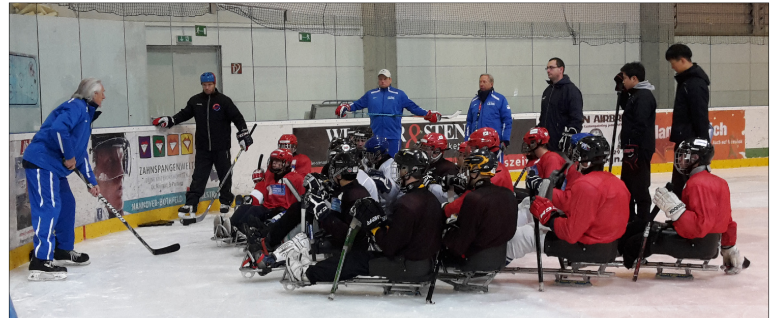
The International Paralympic Committee held its first-ever sledge hockey youth development camp last month in Germany.