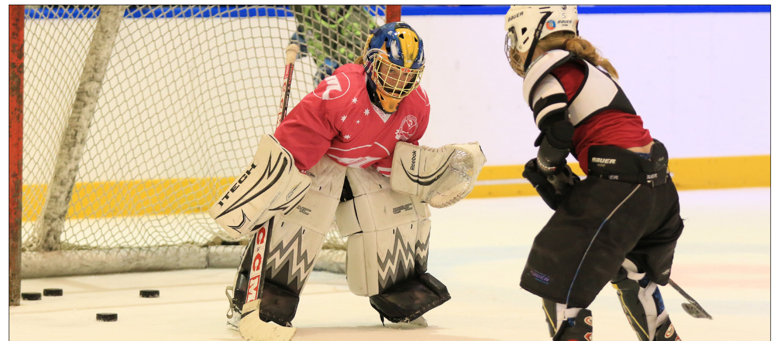
On top of the World Girls' Ice Hockey Weekend event held in Brisbane and the Global Girls' Game in Melbourne, Australia also ran a Come and Try Ice Hockey event in Melbourne designed to introduce the game to girls for the first time.