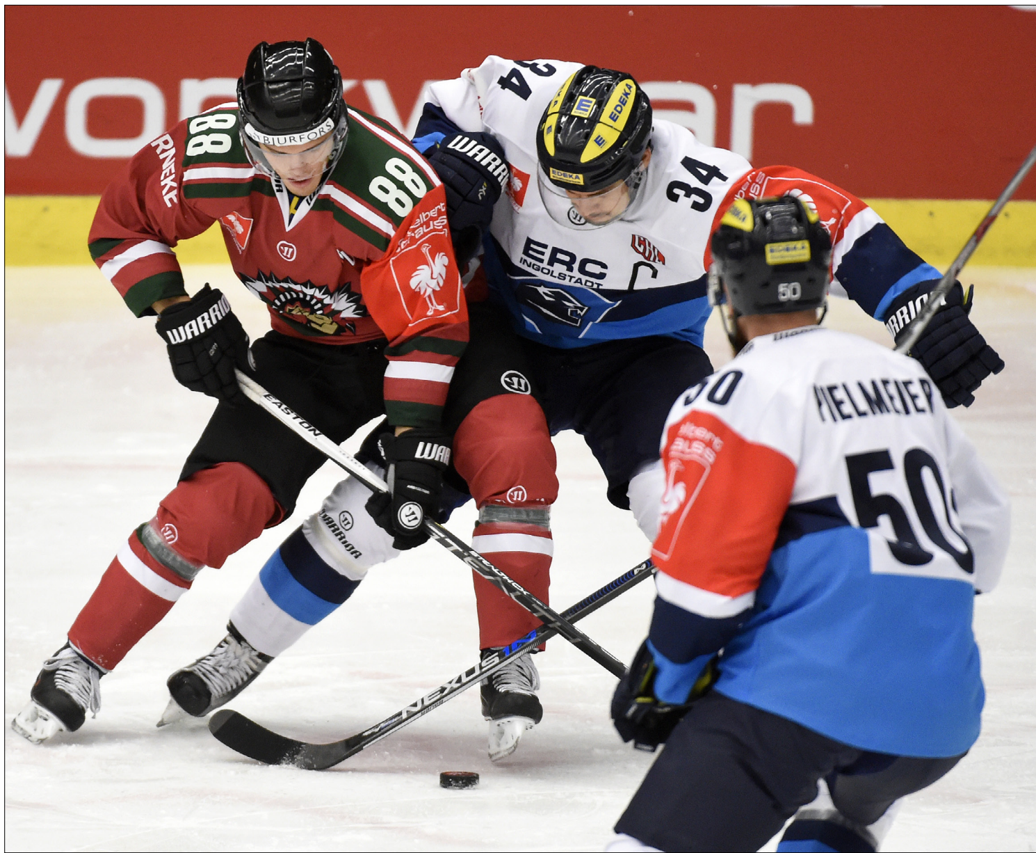
Frolunda Gothenburg eliminated ERC Ingolstadt in a wild comeback win in the Champions Hockey League Round of 32. Following the Round of 16 there are four Finnish clubs, three Swedish, and one Swiss club left in the competition.