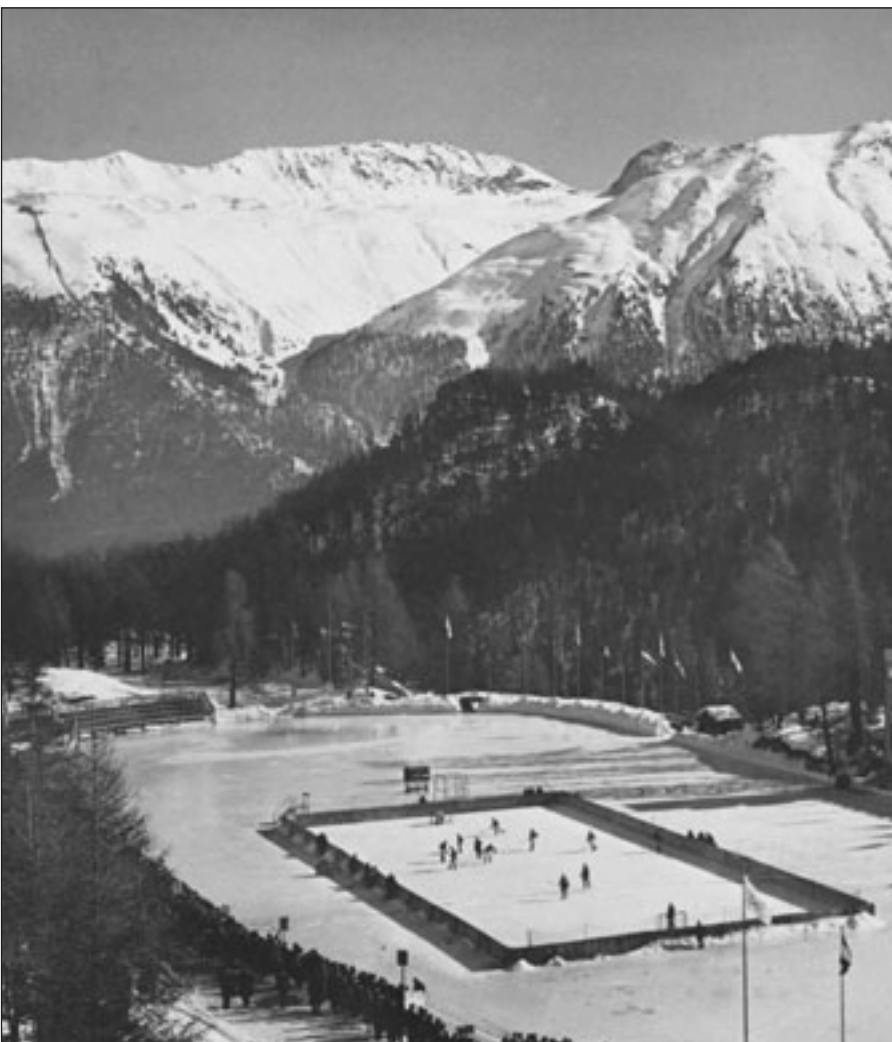
7-1 win over Switzerland, which is still led by the now aging Bibi Torriani (36).

The host again wins Olympic bronze, but one result shows the Swiss' European dominance is all but over. Czechoslovakia wins the silver thanks to an emphatic