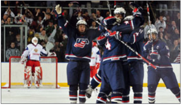
OH SAY CAN YOU SEE: The U.S. was a force in the playoff round at the World U18 Championship, giving up only three goals in three games on the road to gold. It is the fourth U.S. gold medal at the event.

■ Germany and Norway were relegated to Division I. For the Germans, the move down is tough after finishing in fifth place last year and skating in the top division since 2004. Norway was just promoted last year and makes the quick return to Division I.