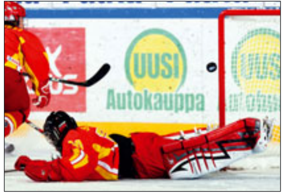
DOWN & OUT: Last year, last-minute heroics saved China its spot in the women's top division, but with two teams getting relegated this year the Chinese could not hang on to their spot among the elite. They finished in last place among the nine nations.

THE CLOCK KEEPS TICKING: Like a Swiss watch, the Finnish women's national team has become a symbol of reliability at the Women's Worlds. The nation has skated in every bronze medal game at the event and this year topped Nordic rival, Sweden, for the bronze medal. The host celebrated its win, but now turns its attention to staying on the podium in 2010.