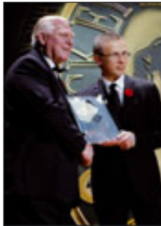
Larionov receives his HoF award

■ Igor Larionov added another honor to his growing resume: induction into the Hockey Hall of Fame. He became only the fifth Soviet-era player so honored, joining Anatoli Tarasov, Vladislav Tretiak, Vyacheslav Fetisov, and Valeri Kharlamov.