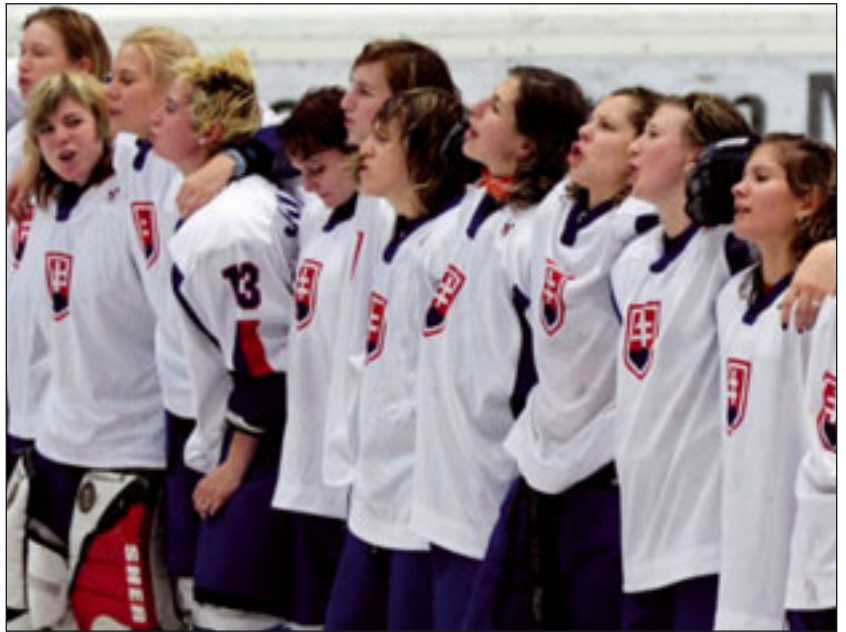
TO VANCOUVER AND BEYOND The Slovakian team listens to its national anthem after beating Kazakhstan, 2-0, and securing its place in the 2010 Olympics in Vancouver.

The Slovak team left Germany directly after its 3-1 win against France, most of the players had to get home to return to the jobs. But now the real work for Slovakia will