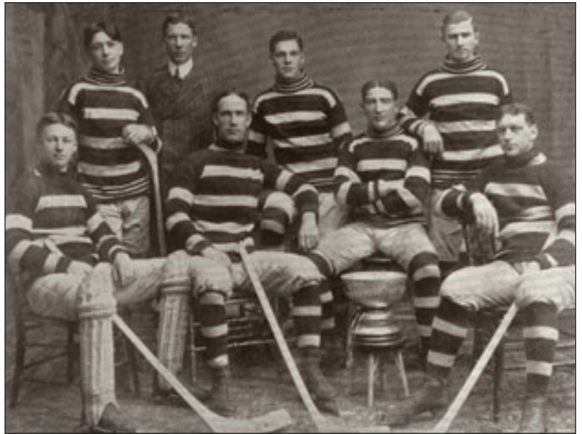
SUPER SEVEN Ottawa's 'Silver Seven' won the city's first Stanley Cup in 1903. They got the names as hockey was played with seven per side back then. Below the Canada women's team wins the 1990 Worlds.

■ The new era of international hockey also brought thrills to Ottawa. The inaugural 1976 Canada Cup kicked off at the Ottawa Civic Centre, one of this year's U20 venues. The host nation, led by superstars like Bobby Orr and Bobby Hull, hammered Finland 11-2 before 9,500 spectators. Canada went on to win the tournament, ousting