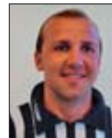
SINDLER - CZE