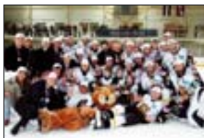
LATVIA: Familiar scene for Riga 2000