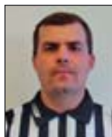
MINAR - CZE