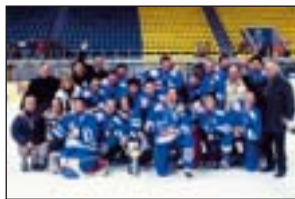
CROATIA: Medvescak struck again