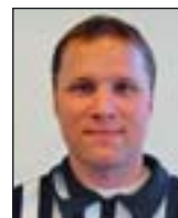
RANTALA - FIN