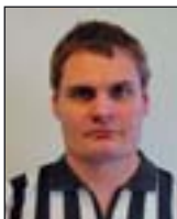
FAVORIN - FIN

■ The idea behind the exchange is to allow the top IIHF officials the chance to call games in another professional league setting. This not only gives them the experience of skating in a different atmosphere among an entirely new group of players, it also allows them to learn what rules are emphasized in other countries and what level of officiating is expected.