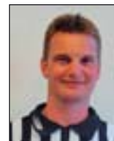
VINNERBORG - SWE

It will be a busy season for the 14 officials taking part in the program. The 14 officials will have called a total of 152 games by the end of the year. Each referee will oversee about 12 games in the six foreign nations, but as the old saying goes, 'a rolling stone gathers no moss'. And these stones will surely be sharper on the ice come World Championships from their European tour during the season.