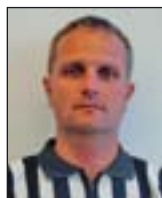
KONC - SVK