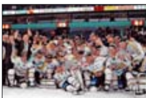
FINLAND: Back-to-back Kärpät