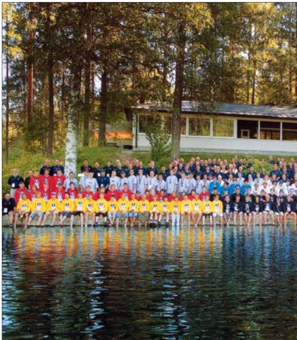
ALL THE COLORS IN THE RAINBOW... and virtually every nation in the hockey family gathered for the group photo at the

And that goal, of course, was the further development of ice hockey all around the globe. It is the ultimate hope of the IIHF that each participant from Vierumaki will take what they learned back to their home nation and