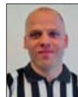
SCHUTZ - GER