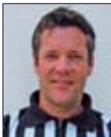
ANDERSSON - SWE

For the second season, 14 of the best European officials will take part in the IIHF Referee Exchange Program. The program sends referees from the top seven European hockey nations (according to the IIHF World Ranking) to officiate games in each other's countries.