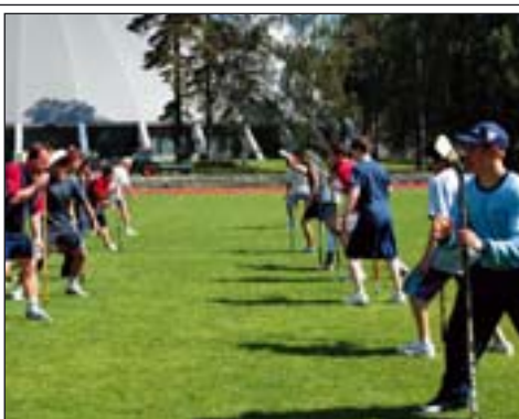
OFF ICE: Players find new goals away from the ice.

■ Most of the drills the players went through needed nothing more than a stick and perhaps a tennis ball. Many of the drills players could do on their own in their spare time, while others they could do with their entire teams back home. Either way, the off-ice training opened up an entire new world of options for both the players and coaches at the Development Camp when they return home.