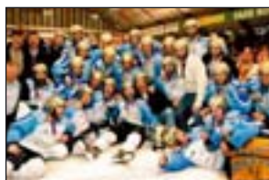
DENMARK: Herning outfoxed all