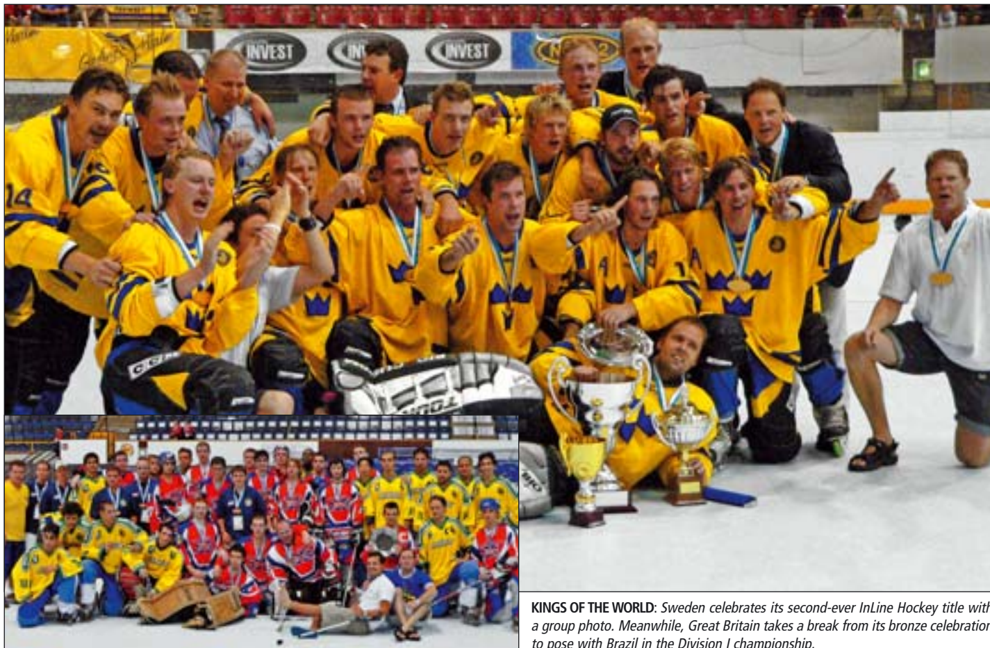
KINGS OF THE WORLD: Sweden celebrates its second-ever InLine Hockey title with a group photo. Meanwhile, Great Britain takes a break from its bronze celebration to pose with Brazil in the Division I championship.