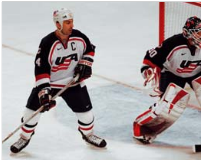
OLD MAN WINTER?: American Chris Chelios could bring a whole new meaning to the term 'veteran' if he is named to the 2006 U.S. Olympic team. The 2006 games would be Chelios' fourth and would come 22 years after he made his Olympic debut in 1984.