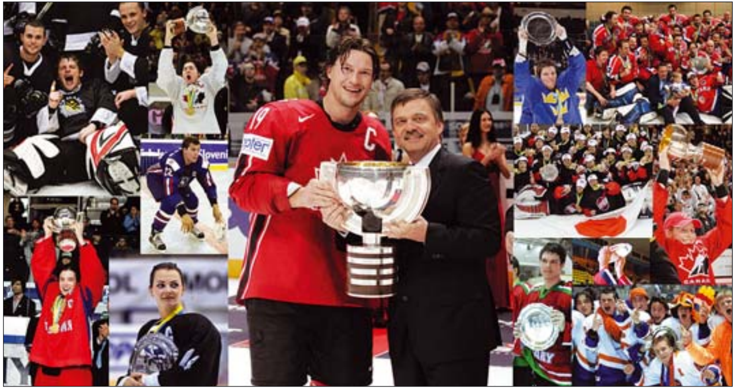
WE ARE THE CHAMPIONS OF THE WORLD: A small sampling of the championship celebrations from all around the globe throughout the 2007 IIHF season.