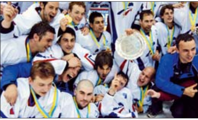
OUI!: The French team will feel right at home during next year's World Championship. The team will be based in Quebec City.

seconds from the end. A huge win for the French, who are now going to Quebec City - a town that their forefathers founded 400 years ago. This will be France's first appearance in the top pool since 2004.