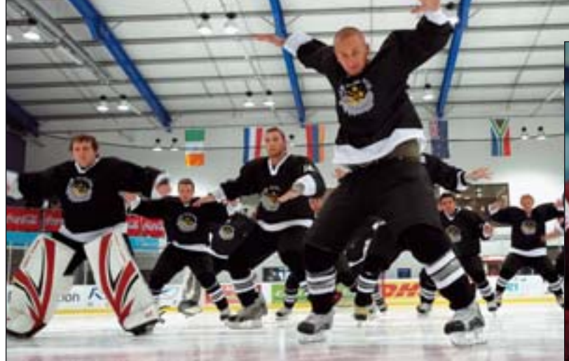
PRE-GAME RITUAL: It's not every day that you can see an ice hockey team do the traditional 'Haka'' dance before a game, but then again, it's not every day that you can see teams from New Zealand (pictured), South Africa, Ireland, Luxembourg and Mongolia all on the ice at in the same tournament as they were in Ireland for the Men's Division III World Championship.