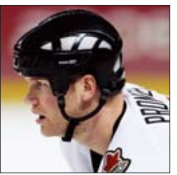
THRICE IS NICE: Chris Pronger in action in Turin

The 2008 edition of the European Champions Cup will be played January 10-13.